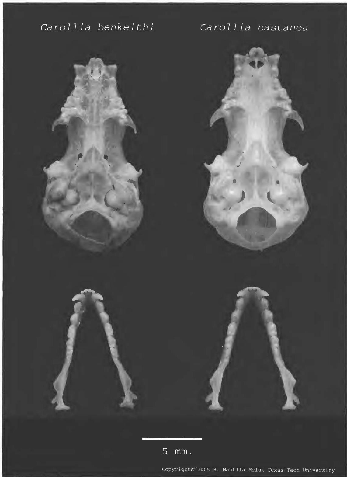
Figure 2. Ventral view of the skull and mandible of the holotype of Carollia benkeithi (TTU 46187) and a specimen of C. castanea (TTU 13177) from Honduras.